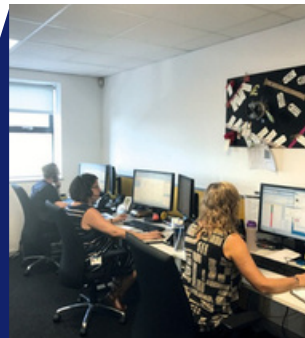
Suffolk Riverside House, Lowestoft, Suffolk, NR33 0EQ