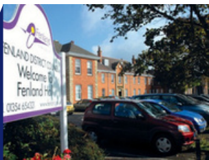
Cambridgeshire Fenland Hall, March, Cambridgeshire PE15 8NQ

angliarevenues.gov.uk/services/Job_vacancies